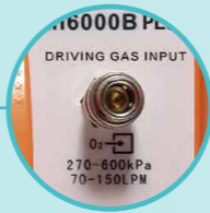
Central gas interface